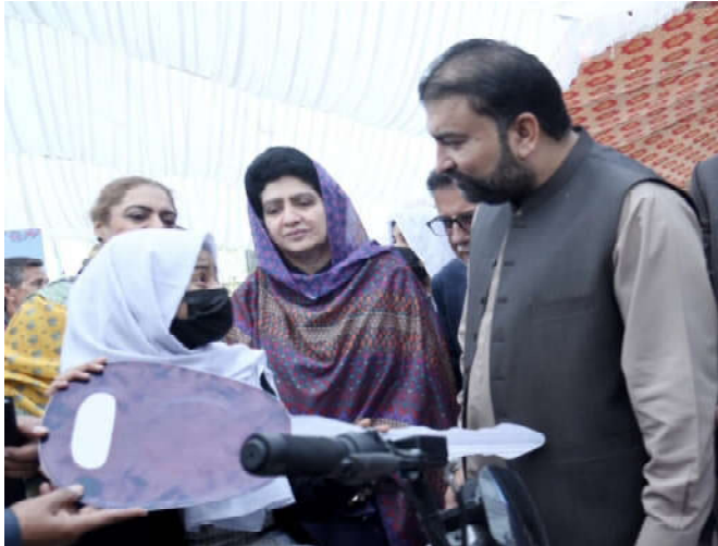
Chief Minister Balochistan, Mir Sarfaraz Bugti talking to a girl student after the provision of a scooter to her.