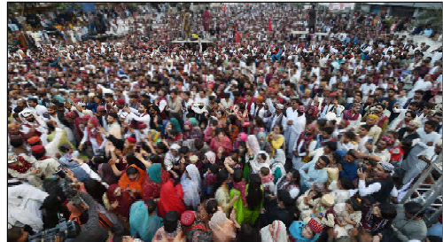
KARACHI: Large number of people wearing traditional dress during the celebrations of Sindh Cultural Day.

The Prime Minister stressed the need for a decisive and compassionate action to empower the most affected by HIV.