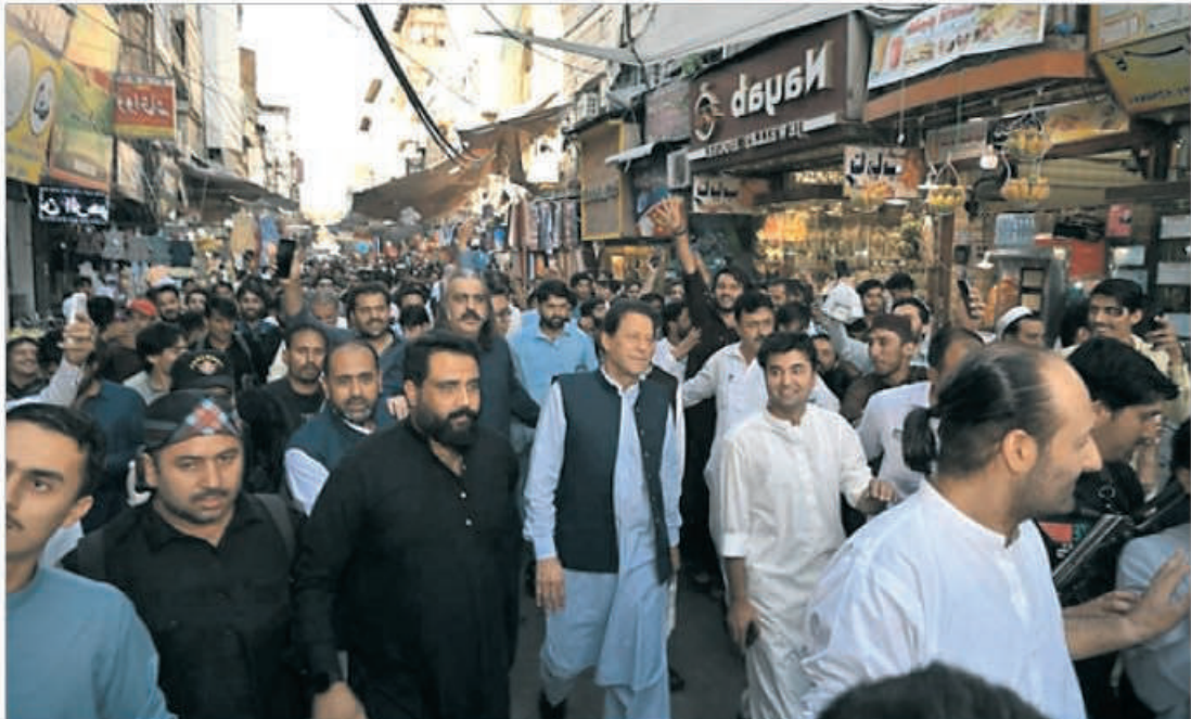
PESHAWAR: Former Prime Minister and PTI chief Imran Khan arrived in Sadar bazaar.

pare an effective mechanism to give response to such disasters timely. First and foremost, the security of forests across Balochistan should be tightened and all-out efforts should be made to protect our natural assets. The provincial and federal governments should also announce a special relief package for the people of Sherani and other affected areas since they were financially dependent on these pine and olive trees for a long time. Environmental experts on national and international levels should be engaged to evolve a strategy for the regrowth of the Sherani forest.