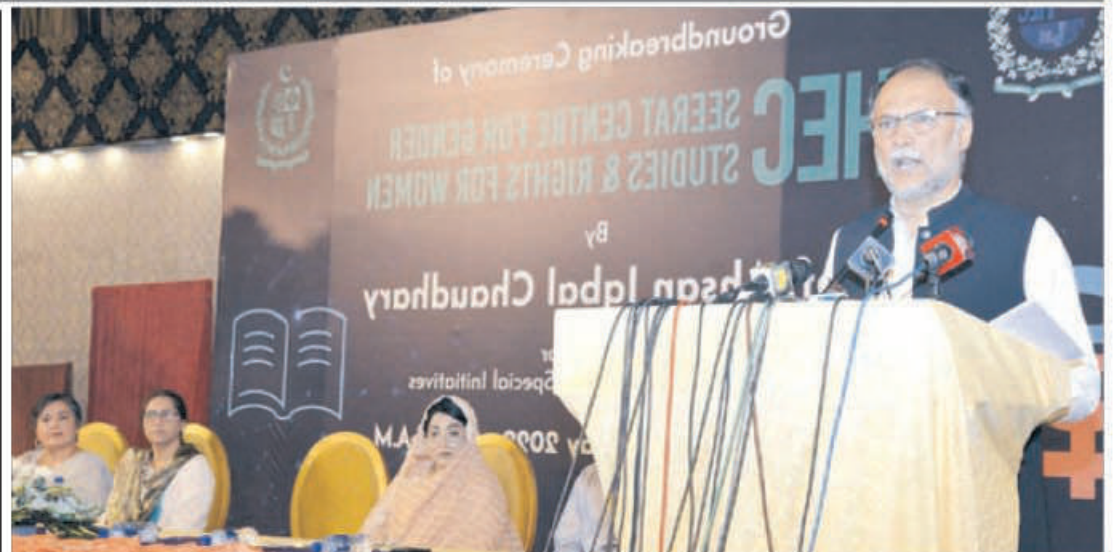
LAHORE: Federal Minister for Planning, Development and Special Initiatives Ahsan Iqbal addressing at the ceremony of groundbreaking ceremony of HEC Seerat Centre for Gender Studies & Rights for Women.