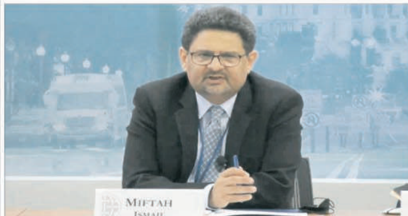
Finance Minister Miftah Ismail speaks to the media in Karachi.

address the challenge of persistently missed children, refusals and fake finger marking during the campaign. Pakistan has reported three cases of polio in 2022 so far. All the cases have been reported in North Waziristan. Earlier, Chief of Army Staff General Qamar Javed Bajwa and Co-Chair of the Bill and Melinda Gates Foundation Bill Gates held a telephone conversation. During a telephonic conversation with COAS Bajwa, Bill Gates appreciated Pakistan's success against COVID-19 despite resource constraints. He also appreciated Pakistan Army for supporting the national polio drive, ensuring proper reach and coverage. Matters related to Pakistan's commitment to comprehensive Polio eradication and COVID-19 were discussed during the conversation. INP